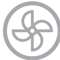
BUILDING AND AUXILIARY MANAGEMENT