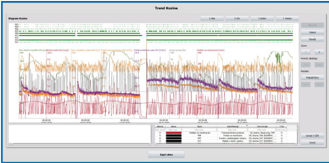
Forecast for a given facility.