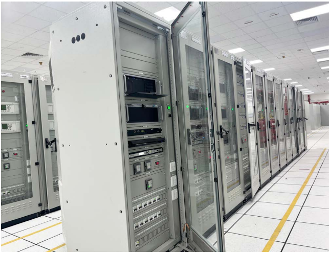
The System House Factory for Electric Panels Co. (SEP) equipped the Frusyah 110/13.8 kV substation with a complete energy automation solution.