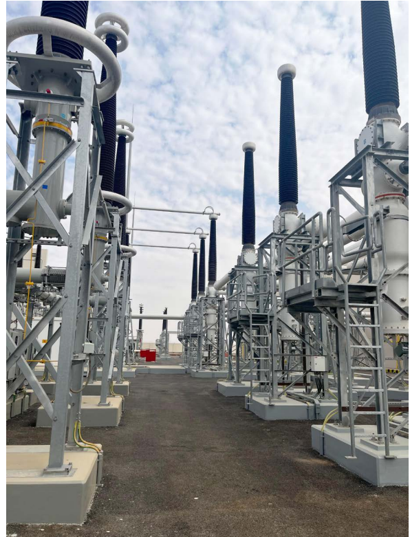
Using COPA-DATA’s hardware-independent zenon software platform, System House Factory for Electric Panels Co. (SEP) has been implementing efficient and reliable substation automation solutions making it more feasible for the Saudi Electricity Company (SEC) to meet the growing demand for renewable electricity.

zenon not only reduces engineering time, it optimizes processes, increases system stability and minimizes downtime. The user-friendly nature of the software platform enables end users to maintain the system with their own staff. Consequently, SEP has made the zenon software platform its preferred choice for automation systems, both for new energy projects and retrofit applications.