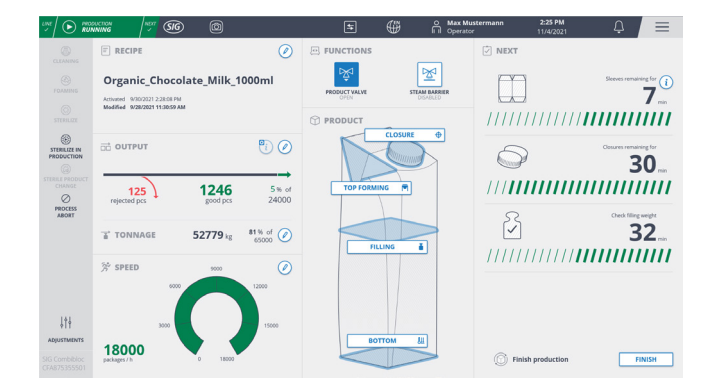
The SIG NEO dashboard displays all the relevant information for HMI operators in a clear and intuitive manner.

Senior Product Manager at SIG. The increasing shortage of skilled workers and the high cost of training on equipment are major considerations. The challenge was to visualize highly complex technical processes in such a way that operators could run them without error after only a short period of training. At the same time, the equipment increasingly has to be flexible. In addition to different products and recipes, the machines have to cover the widest variety of different packaging sizes and designs, limited editions and seasonal specials – in just a few steps or via easy, self-explanatory clicks on the display.